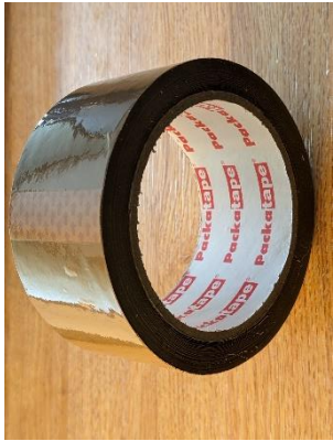
PRINT FOUND ON THE BROWN TAPE SC/8